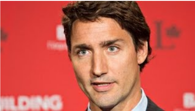
Justin Trudeau Denies That Canada Is at War with Islamists...