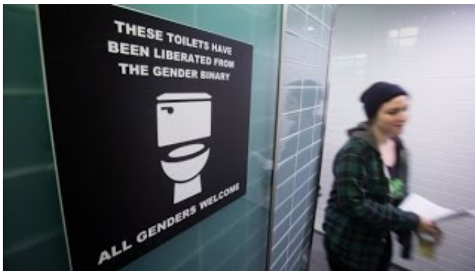
Conservative Party colludes with Liberals to pass Transgender Bill C...