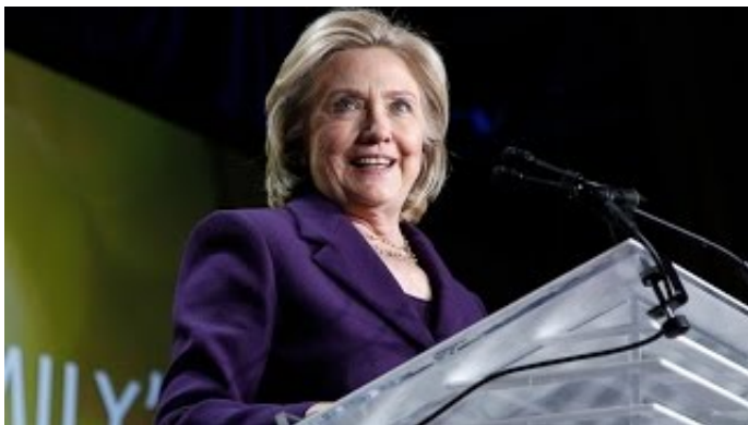
Stop Hillary Clinton's War on Christians