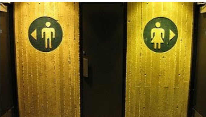
Donald Trump Supports Men Using Women's Bathrooms