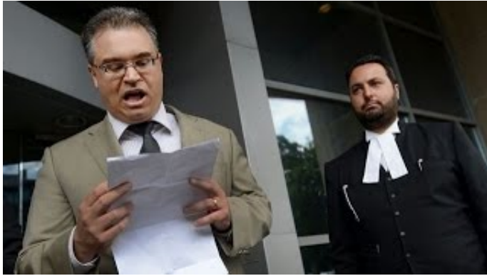
Parents Have No Right to Withdraw Children from Radical Sex...