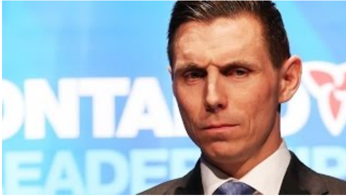
Reject Ontario PC Leader Patrick Brown's Promises to Liberalize the...