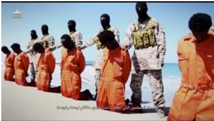
Jesus Christ Warned Us That We Would Be Persecuted