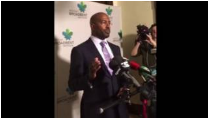
Van Jones Responding to Media about 'Whitelash' Comments