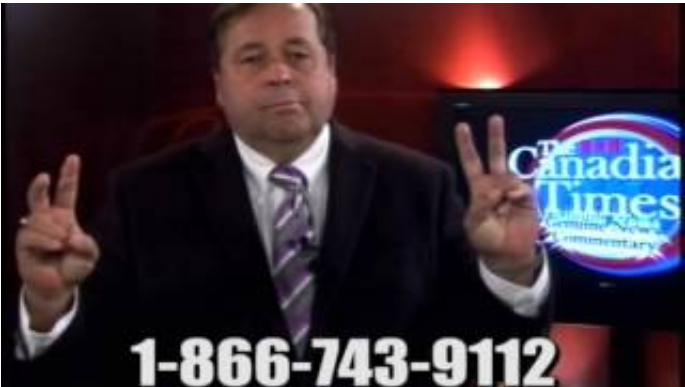
Premier Kathleen Wynne declares War on "Mother" part2