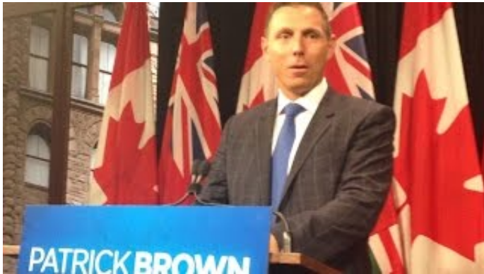
PC Leader Patrick Brown Says Party Is Now Socially Liberal...