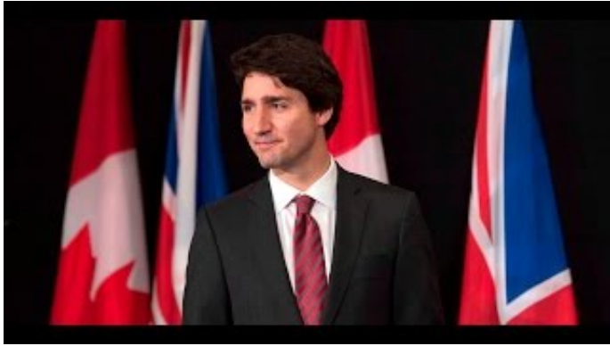
Trudeau's Bail-In Prophesied 2,000 Years Ago In Bible