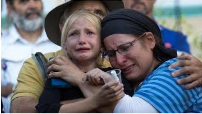
Palestinian Terrorist Slaughters 13 Year Old Israeli Girl While She...