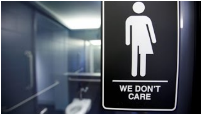
Canada Doesn't Care About Children Anymore