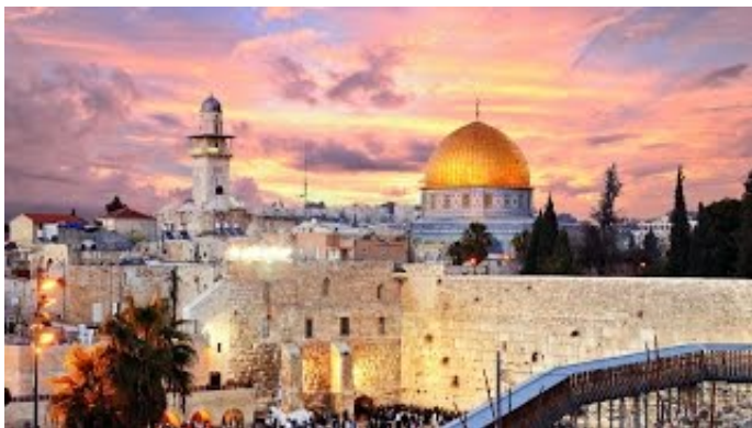
Christian Supporters of Israel Began Modern Zionism