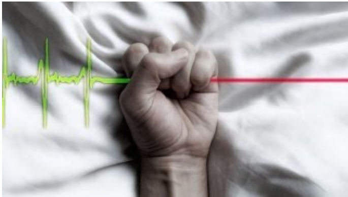
Justin Trudeau presents Bill C-14 A licence to kill