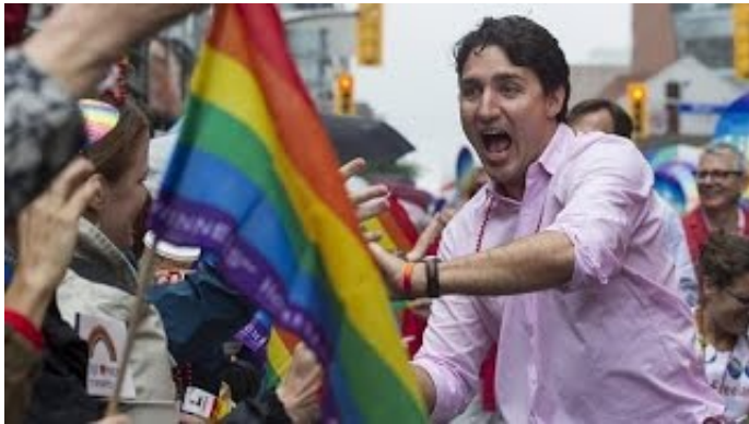
Trudeau Proposes a Vague and Reckless Transgender Bill