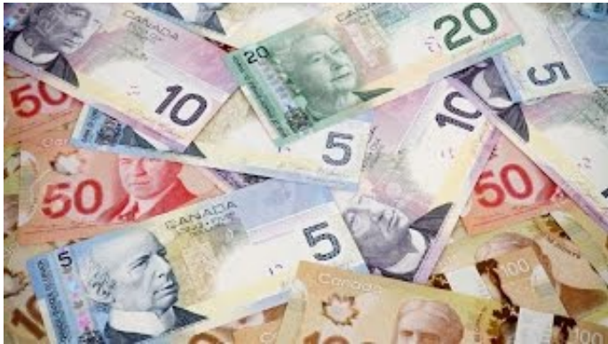
Trudeau's Bail-In Now Law to Allow Banks to Confiscate Your...