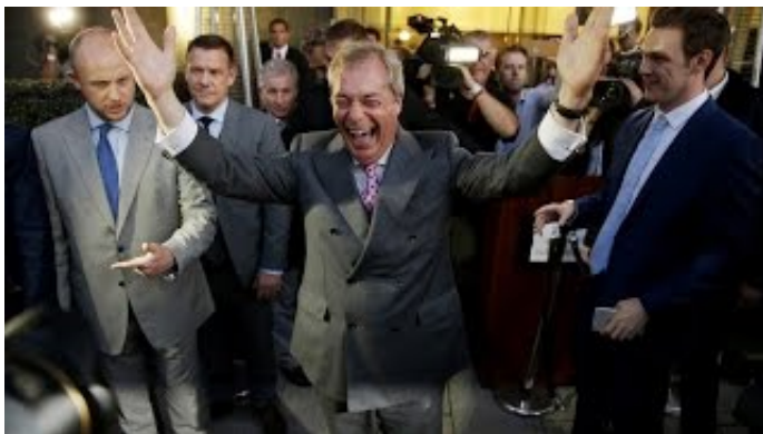
UK Votes to Leave the European Union in Brexit Vote...