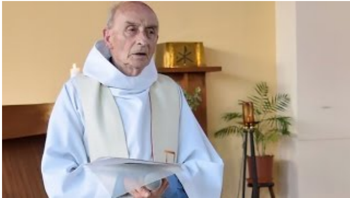
ISIS Continues War on Christians