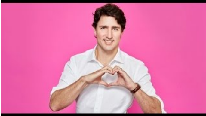
Trudeau Announces Reduction in Age of Consent for Anal Sex...