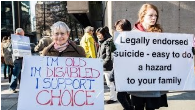
Bill C-14 Has Passed: It Is Now Legal for Doctors...