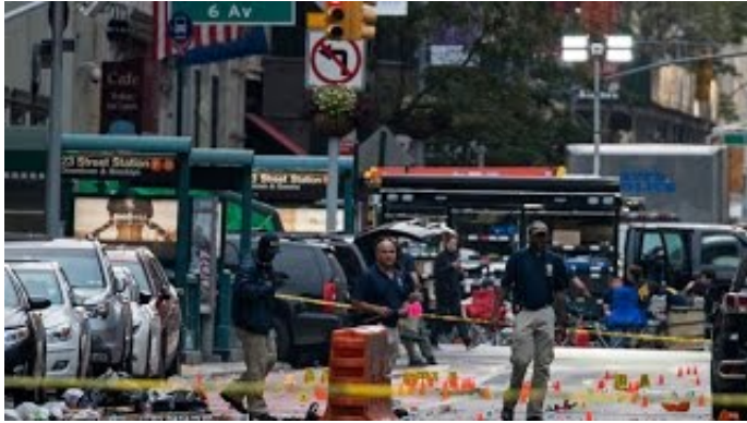
Media Misleads Public with New York City Bombing