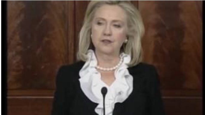
Hillary Clinton's Foreign Policy Brought Destruction to The Middle East...