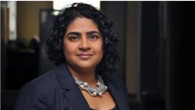
Ontario Human Rights Commission Says It Is Discrimination to Not...