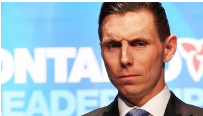
Patrick Brown Cannot Lead by Deceit