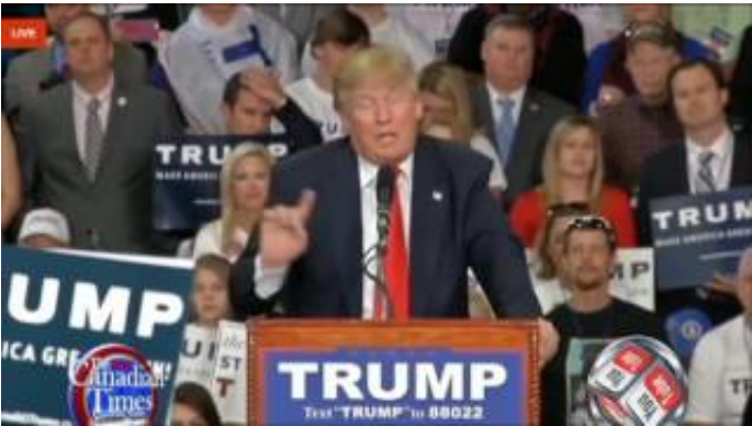
Donald Trump Promises to Free Pastors by Repealing The Johnson...