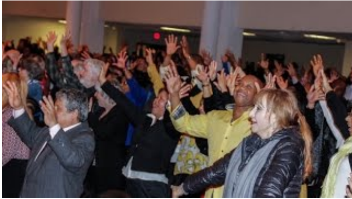
Christians United for Israel Canada Celebrates 68th Anniversary of Israel's...