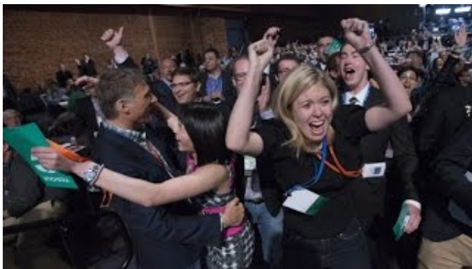
LGBT Activists Take over Conservative Party of Canada