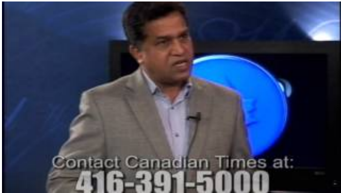
Thousands of Muslims Around the World Are Coming to Know...