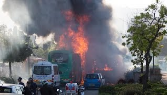
Terror in Israel on Holocaust Remembrance Day