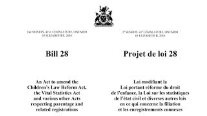
Premier Wynne Declares War on "Mother"