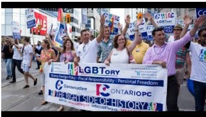
Rona Ambrose Making the Conservative Party a Liberal Lite Party...