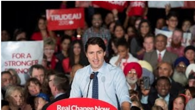
Canada Doesn't Care About Women Anymore