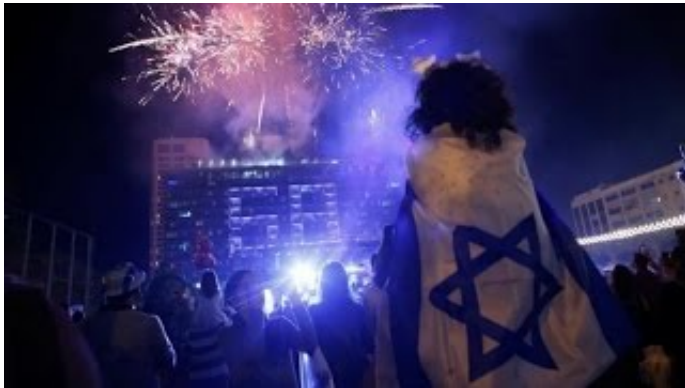
Israel Celebrates The 68th Anniversary of its Rebirth as a...