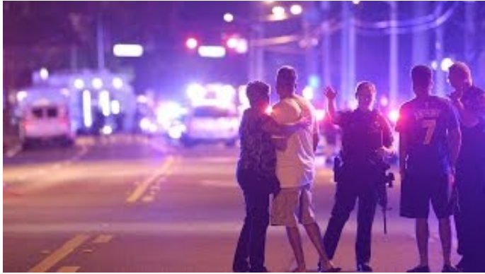
Orlando Shooting Inspired by Islam's Battle of Badr