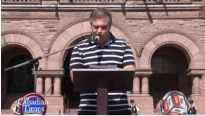
Parents Rally at Queens Park to Protect Children from Abuse...