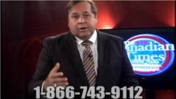
Bill 16 Men into Women's' Spaces and Ontario Allows Men...