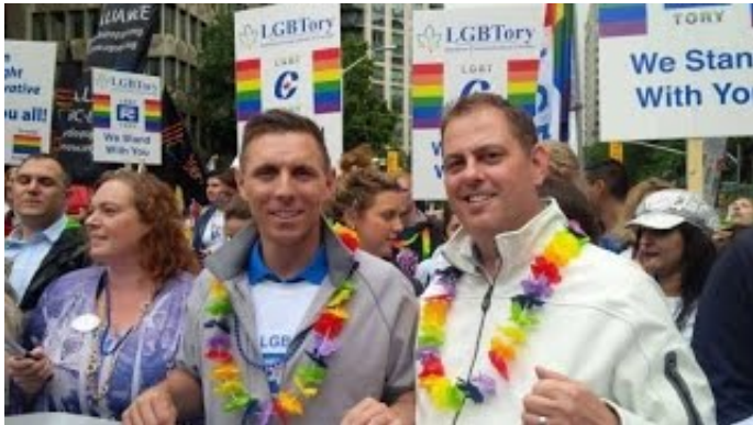
A Liberal-Lite Conservative Party Leaves Canada With No Real Opposition...