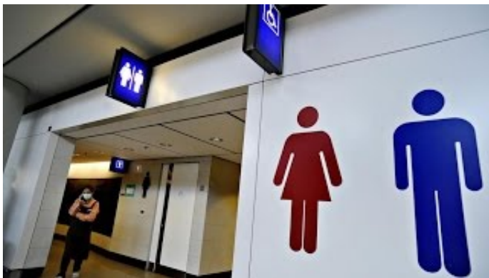
Men Are Using Transgender Guise to Attack Women and Girls...