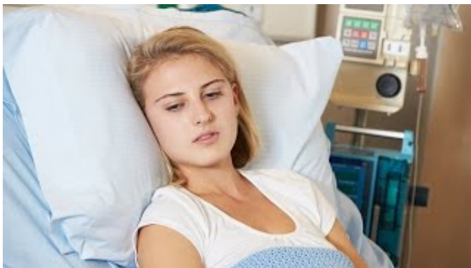
Liberals Rushing Euthanasia Bill Through Parliament