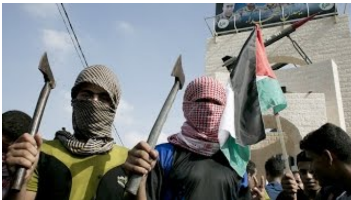
Anti-Semitism is Spreading Like Wildfire