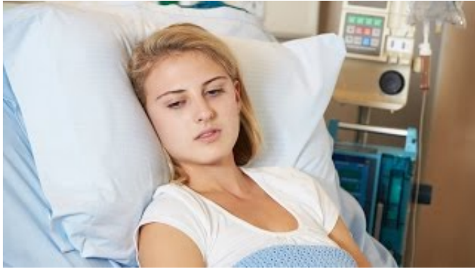
MP's Pass Licence to Kill Bill C-14